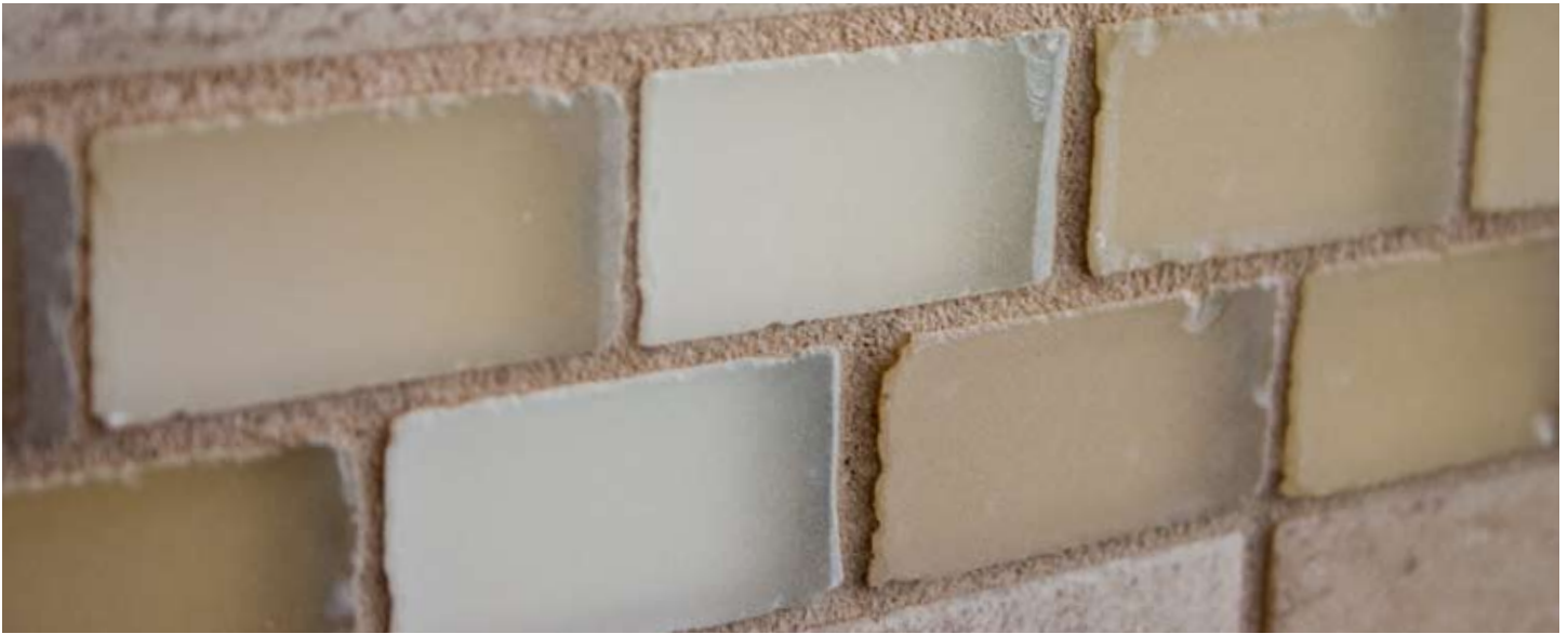
Frosted glass with shaded color blends and irregular tumbled edges.